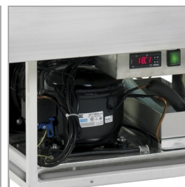
Automatic evaporation of defrost water