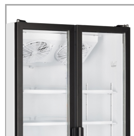
Full height doors