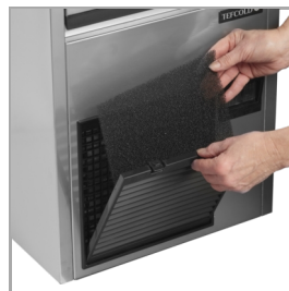
Easy to clean condenser filter