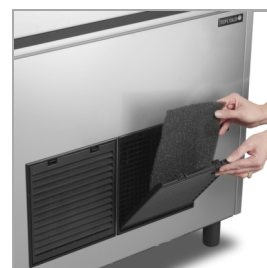
Easy to clean condenser filter