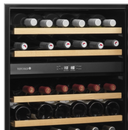
Wooden drawing shelves