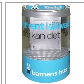
Well suited for graphics