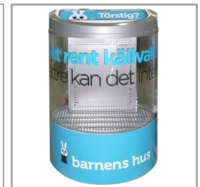
Well suited for graphics